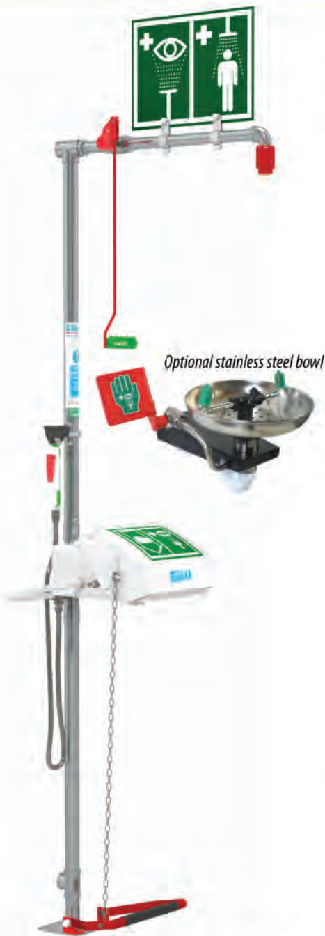
Shown with optional Optiflex, signage and foot pedal

The modular approach to construction provides maximum flexibility. All optional fittings including eyewash, eyewash operation pedal, signage and lighting can be easily retro-fitted to your safety shower if required.