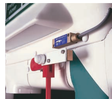
Proximity switch detail